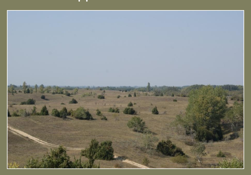
The mounds of Fülöpháza