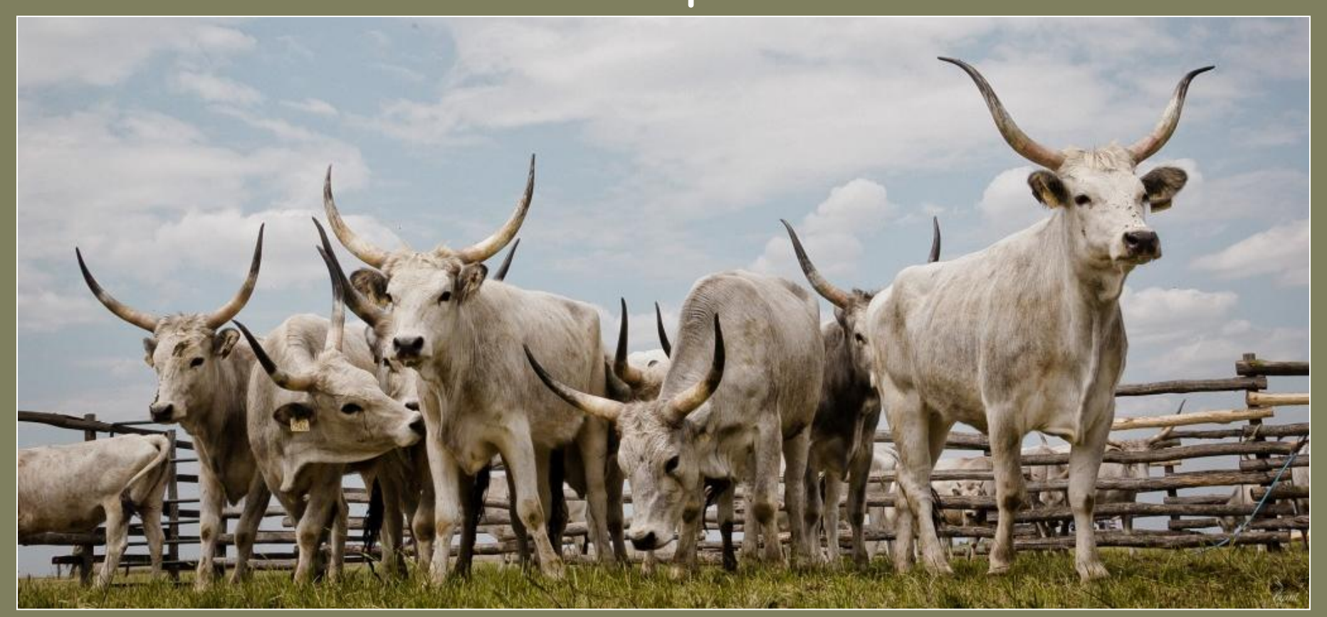
Hungarian Grey cattle

The Kiskunság National Park contributes to the protection of the ancient domesticated species, breeds and their genom with the aim of scientific research, they help visitors meet these species.