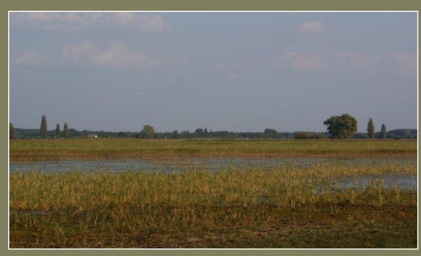
Szappan-szék /a sodic lake/